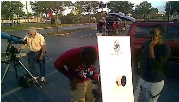
Students get their first look at the Sun compliments of our Glackin Solar Telescope.

After dark, we set up in a mostly lighted parking lot and had intermittent but good views of the Moon, Jupiter, plus a few stars. My guess was that none had ever looked through a scope.