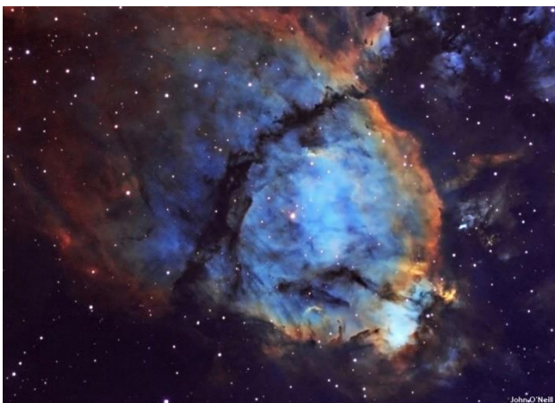
NGC 896