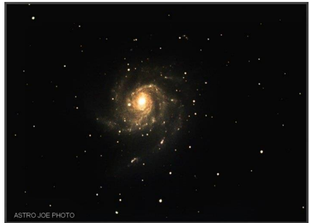
M-101 by Joe Canzoneri