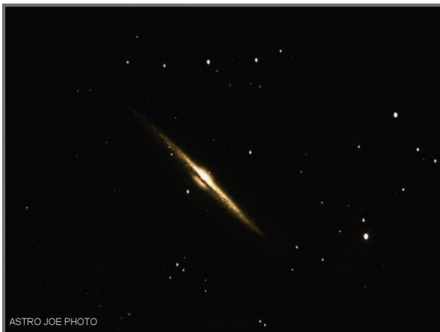
NGC 6465, The Needle Galaxy by Joe Canzoneri

Here are a few nice images from our members.