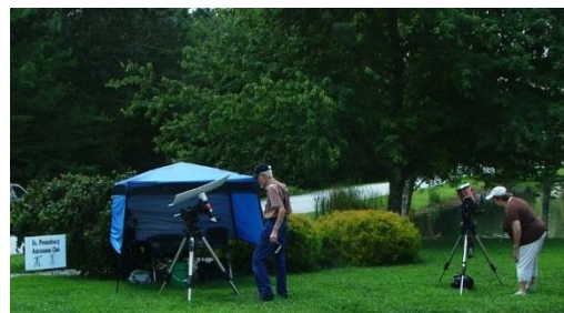
From Crossville, TN